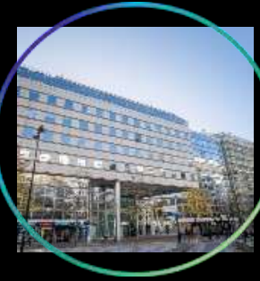
Transport Spatial (185)