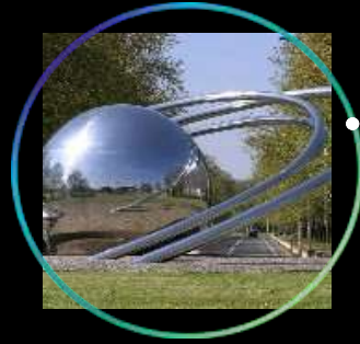
Centre Spatial de Toulouse (1 759)