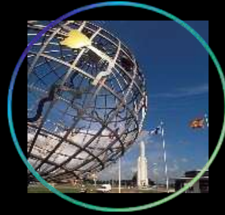
Centre Spatial Guyanais (254)